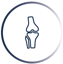
Bone & Joint Pain