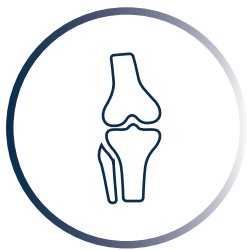
Bone & Joint Pain