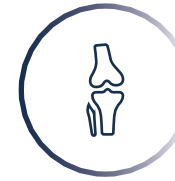
Bone & Joint Pain