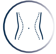
Weight Loss Surgery