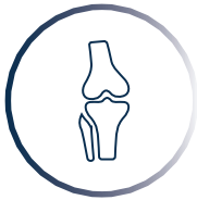
Bone & Joint Pain