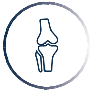
Bone & Joint Pain