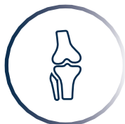
Bone & Joint Pain