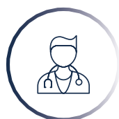
Consultant led care