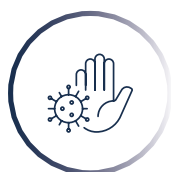
Excellent infection prevention