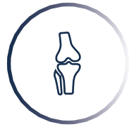
Bone & Joint Pain