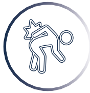
Spine & Back Pain