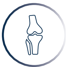
Bone & Joint Pain