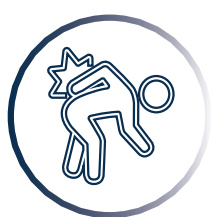
Spine and Back