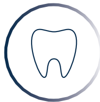
Oral & Maxillofacial Surgery