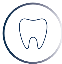
Oral & Maxillofacial Surgery