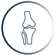
Bone & Joint Pain