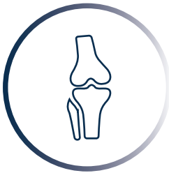
Bone & Joint Pain