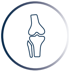
Bone & Joint Pain