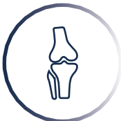
Bone & Joint Pain