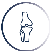
Bone & Joint Pain