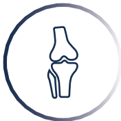
Bone & Joint Pain