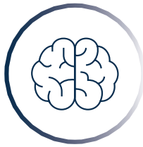
Neurology & Neurosurgery