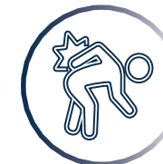
Spine and Back