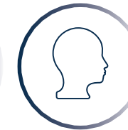
Ear, Nose & Throat Conditions