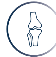
Bone & Joint Pain